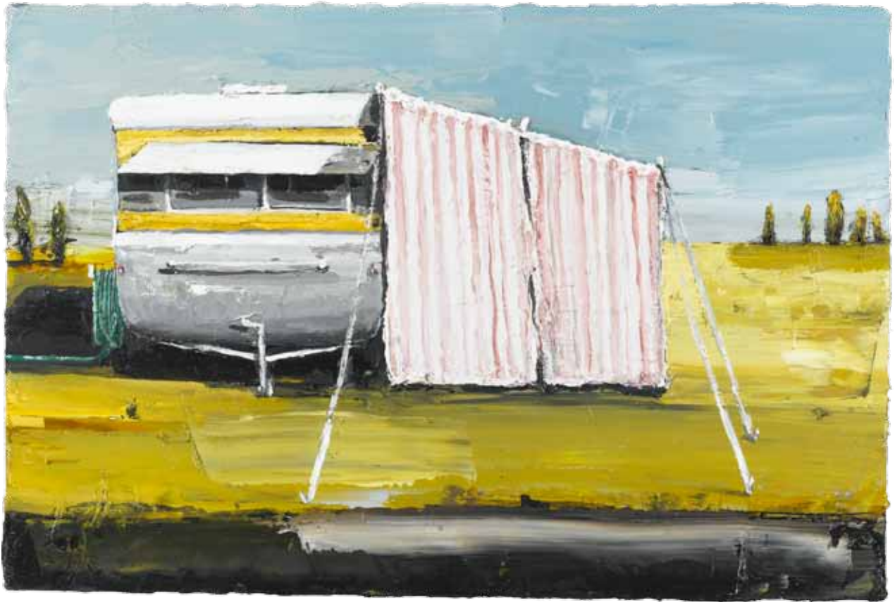
Narrabeen 2012 oil on canvas 41x61cm