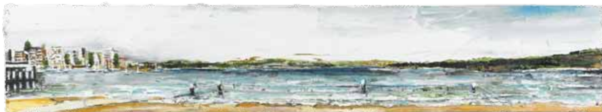
Shark Net Marine Land 2013 oil on board 14x66cm