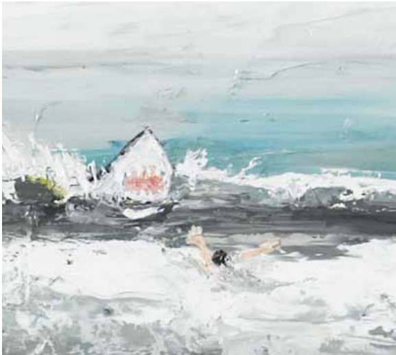
Morning Swim Detail