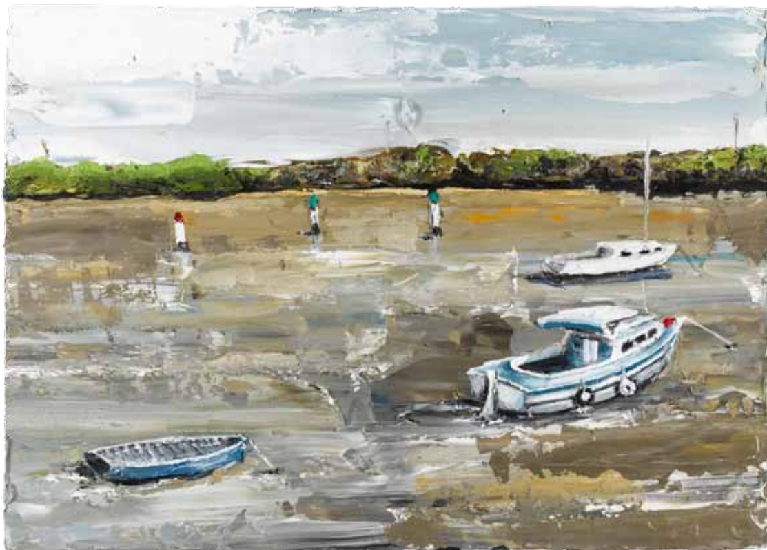
Over the Other side 2012 oil on board 30x44cm