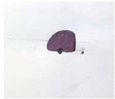
My Super 2012 Sizes variable mixed media on paper