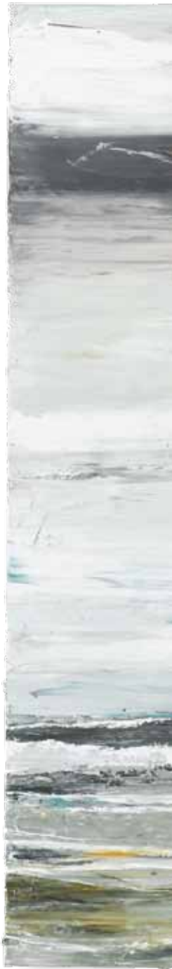
Morning Swim 2013 oil on canvas 122x152cm