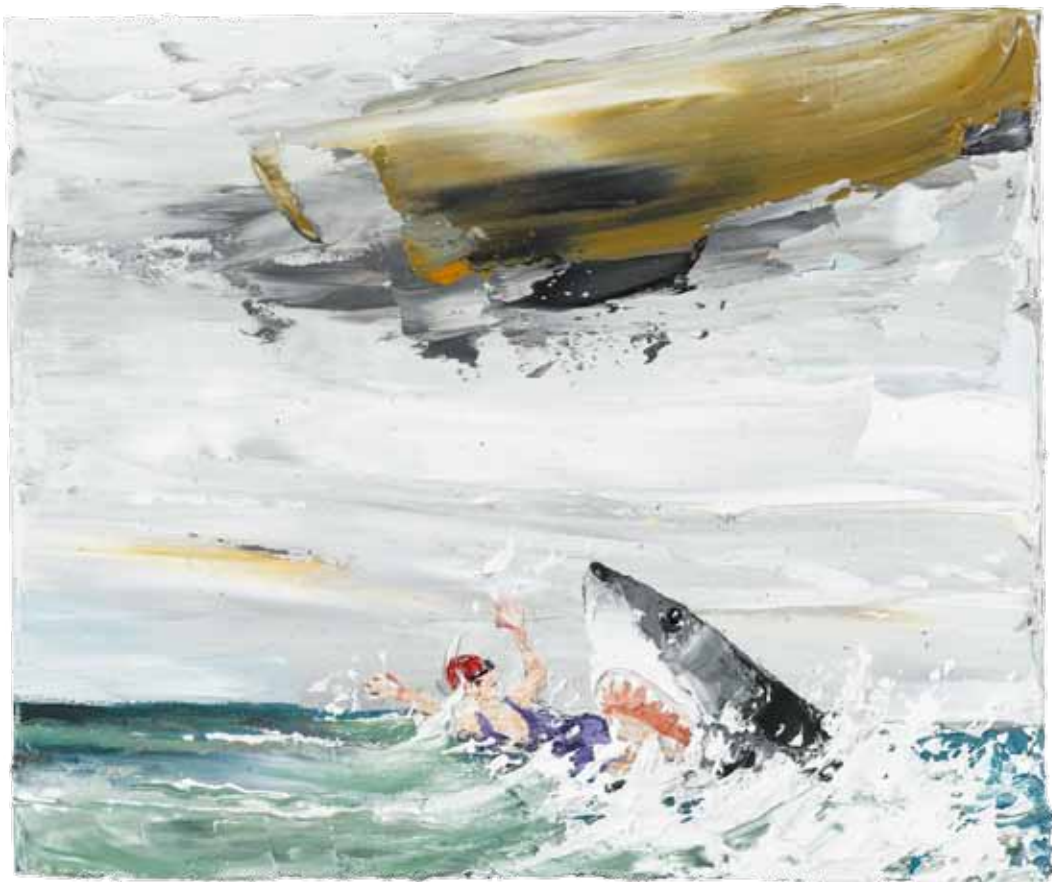
New Purple Swimmers 2013 oil on canvas 25x30cm