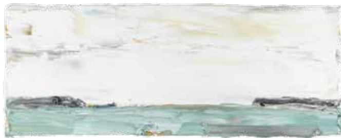
The View 1 2013 oil on board 9x22cm