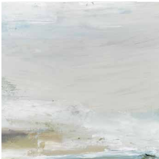
Mist 1 2012 oil on paper 30x30cm