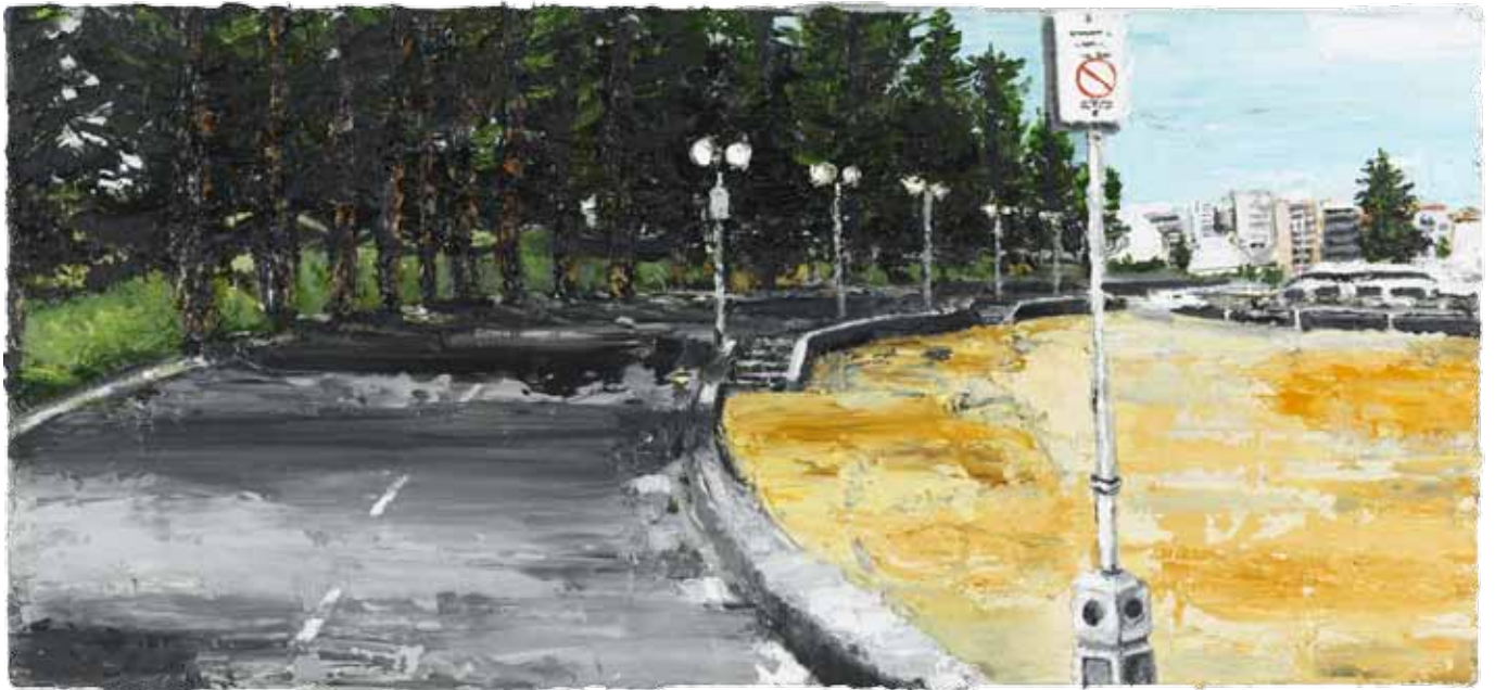
Walk to the Ferry 2013 oil on canvas 30x66cm