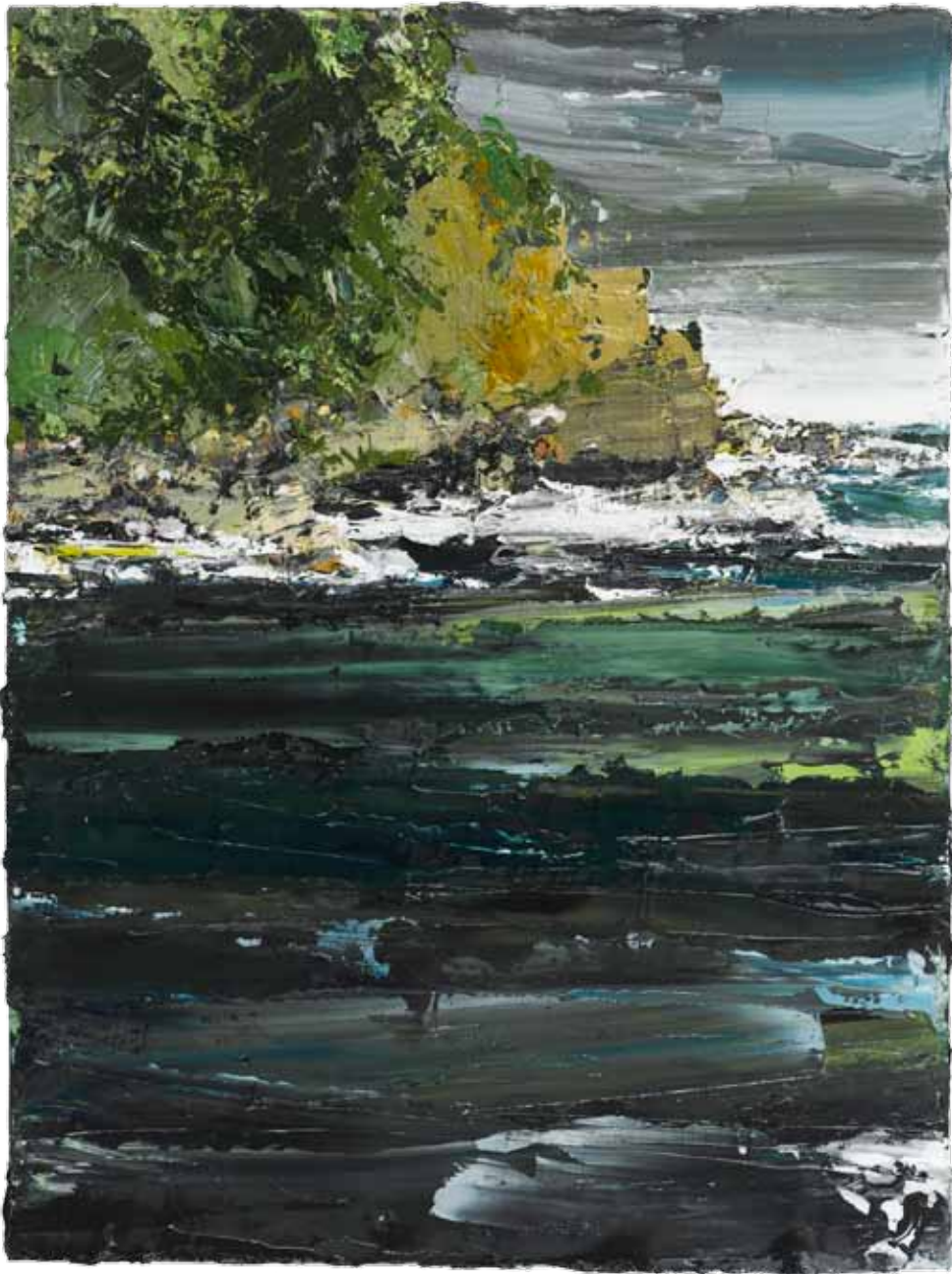
Near the Lower Casemate 2013 oil on canvas 51x38cm