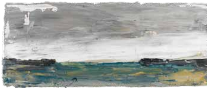
The View 2 2013 oil on board 9x22cm