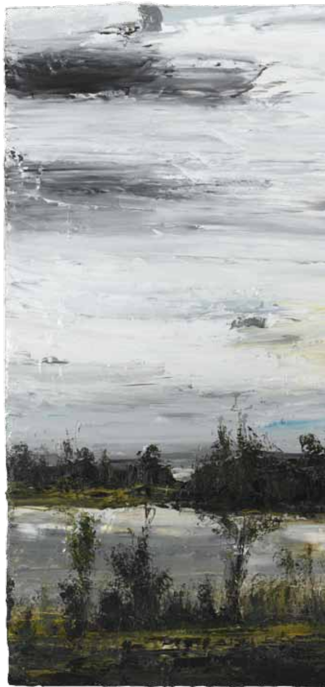
Manly Dam 2013 oil on linen 137x214cm