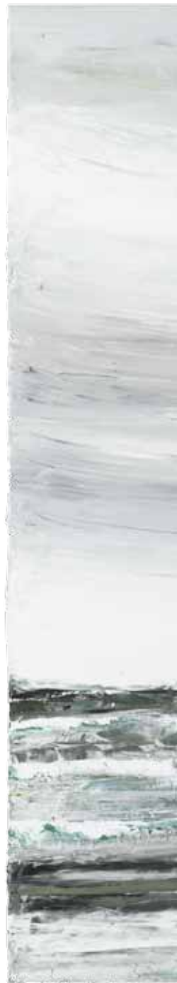
Winning 2013 oil on canvas 122x152cm