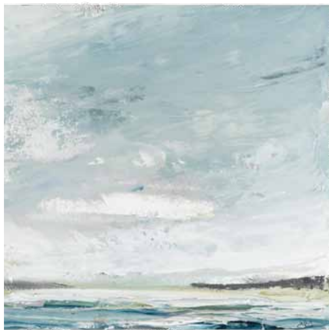
Mist 2 2012 oil on paper 30x30cm