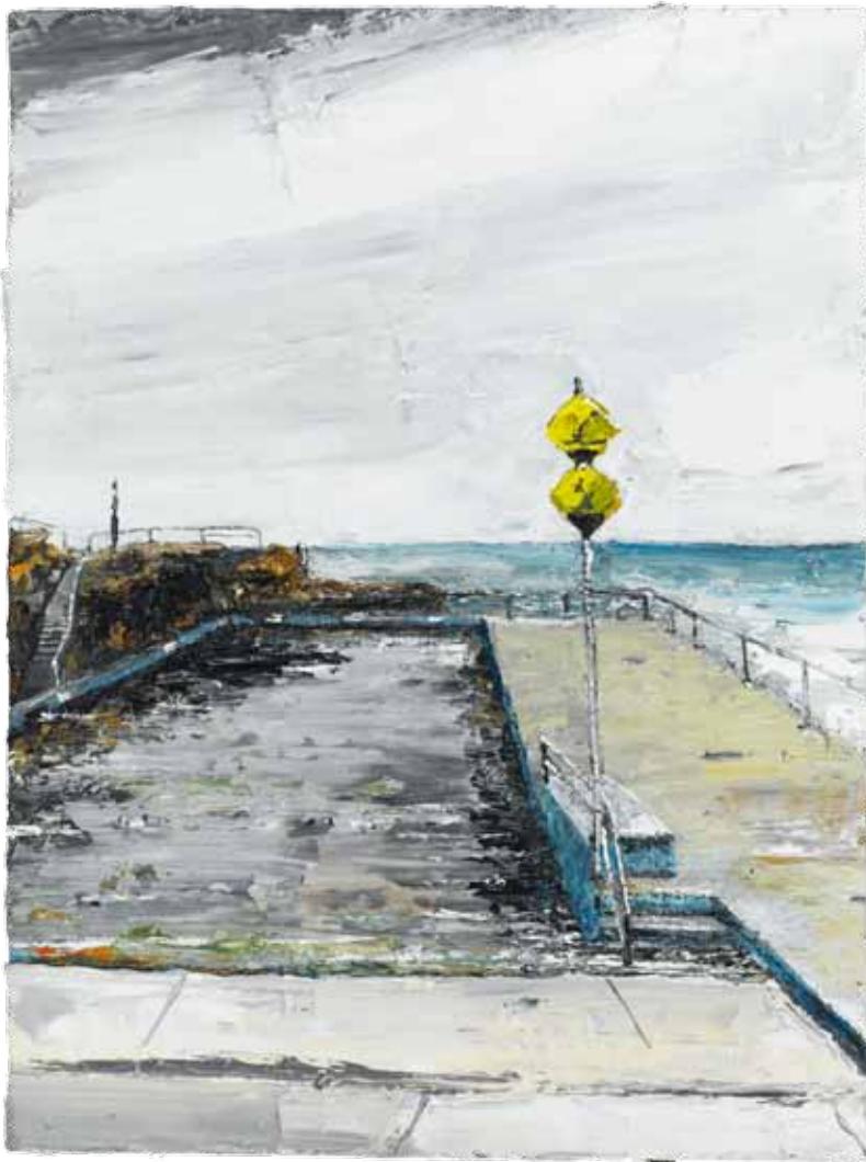
Queenscliff 2013 oil on canvas 51x38cm