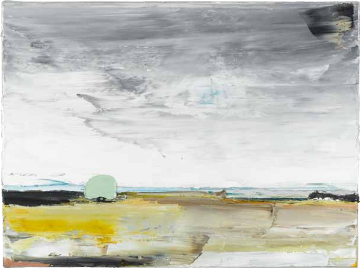
Low Tide Holiday 2013 oil on canvas 38x51cm