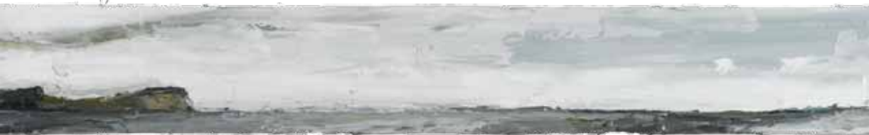
Off Freshy 2013 oil on board 14x200cm

26 April - 2 June 2013, Manly Art Gallery & Museum West Esplanade Reserve, Manly, NSW Phone 61 2 9976 1420