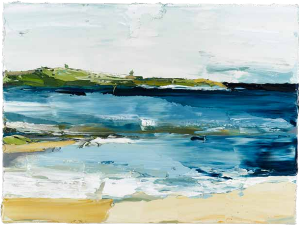
Mona Vale where the Beaches Turn 2012 oil on canvas 38x51cm