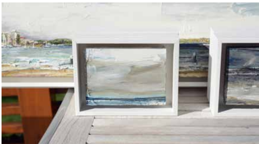
Set of small oils 2013