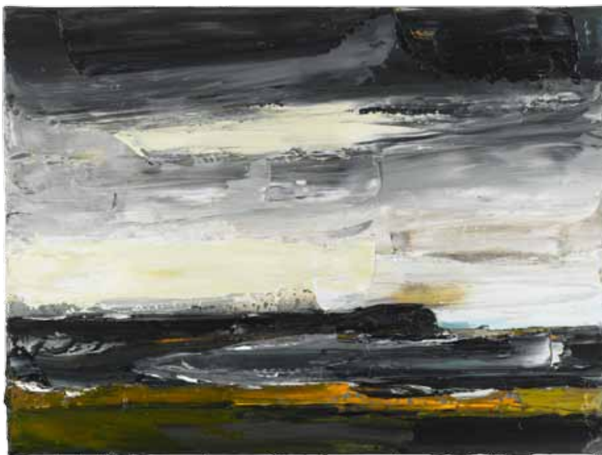
Dee Why 2012 oil on canvas 38x51cm