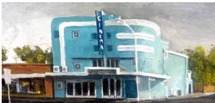
Collaroy Cinema 2013 oil on board 14x30cm