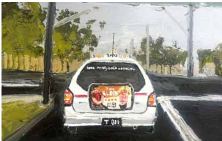
www.manlycabs.com.au 2013 oil on board 14x30cm