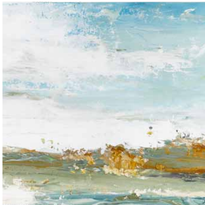
Beach 3 2012 oil on paper 30x30cm