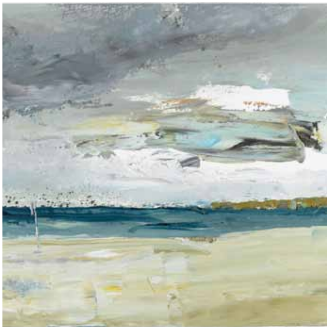
Beach 2 2012 oil on paper 30x30cm