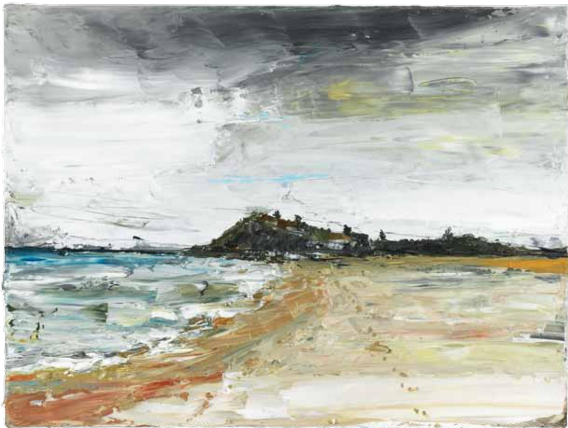
Newport 2013 oil on canvas 38x51cm